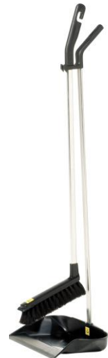
Part No.: 6101.K