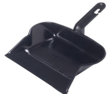
Part No.: 6101.S.290