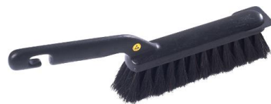
Part No.: 6101.160.N